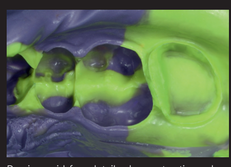
Precise, void-free details plus contrasting colors for excellent readability.

High-precision 1-step impression made with 3M™ Impregum™ Super Quick Polyether Impression Material (Medium and Light Body) and single-use 3M™ Impression Tray.